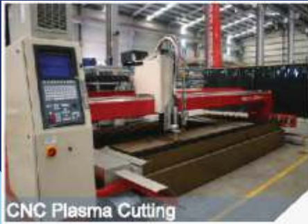
CNC Plasma Cutting